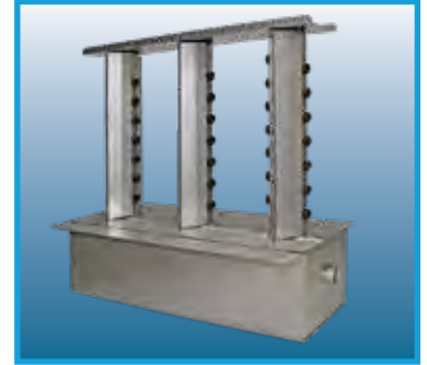
Multi-Steam HD: High efficiency steam distributor (channel and header) with patent pending steam ejector eyelets