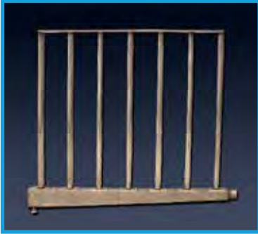
Multi-Steam SD: For absorption distance of less than 900mm

For duct distribution installation, the SKS4 requires either a Multi-Steam SD, Multi-Steam HD, or S.A.M.E2 as a steam dispersion system.