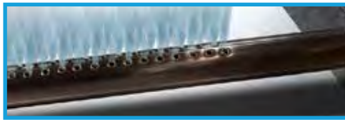
S.A.M.E2: For absorption distance of less than 1500mm