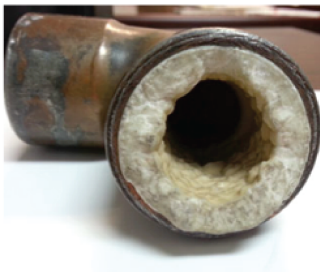
Fig. A – Hard water scale buildup on the inside of a pipe

This is hard on the system and substantially reduces efficiency.