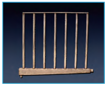
For absorption distance of less than 3' (914mm)

For fan distribution installation, the SK300 can supply steam directly with an SDU (Steam distribution unit) into the room without a duct network or for a localized area.