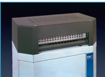
For Models SK302-SK330